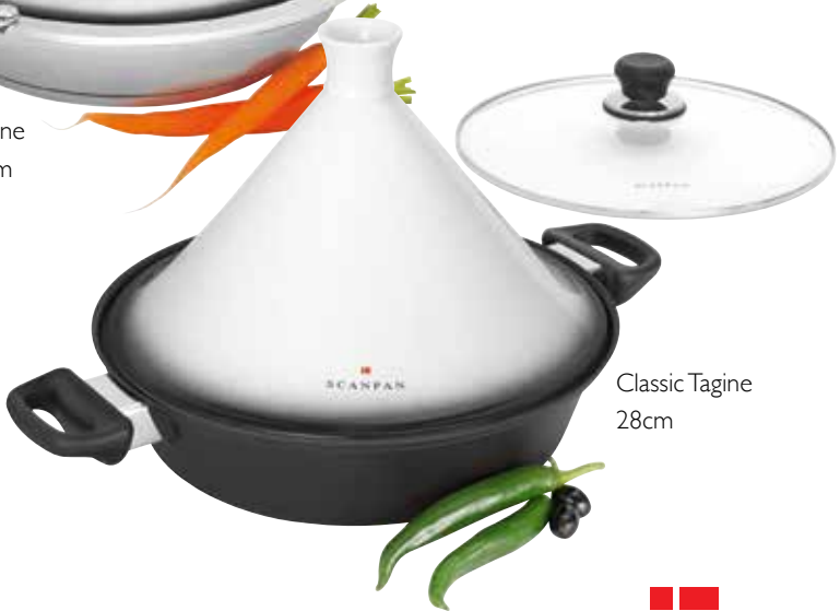
Classic Tagine 28cm