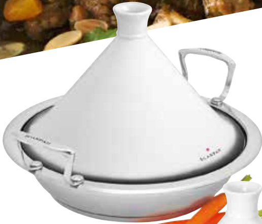
Impact Tagine 24/28/32cm